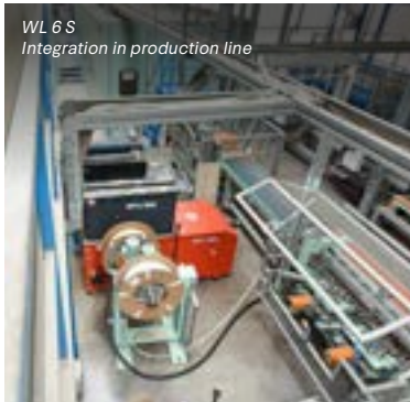
WL 6 S Integration in production line