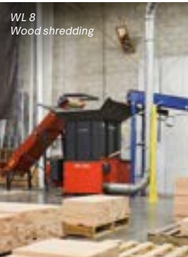
WL 8 Wood shredding