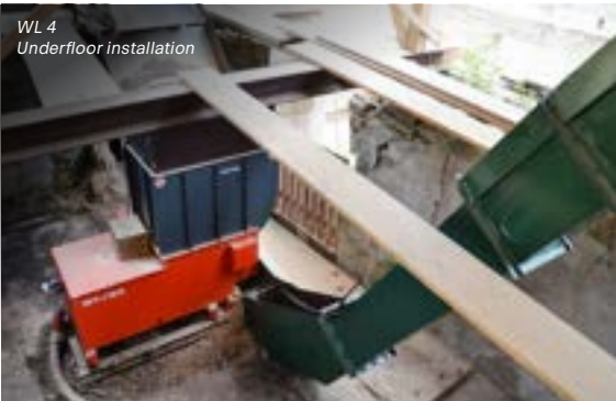
WL 4 Underfloor installation