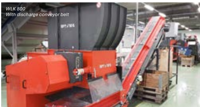
WLK 800 With discharge conveyor belt